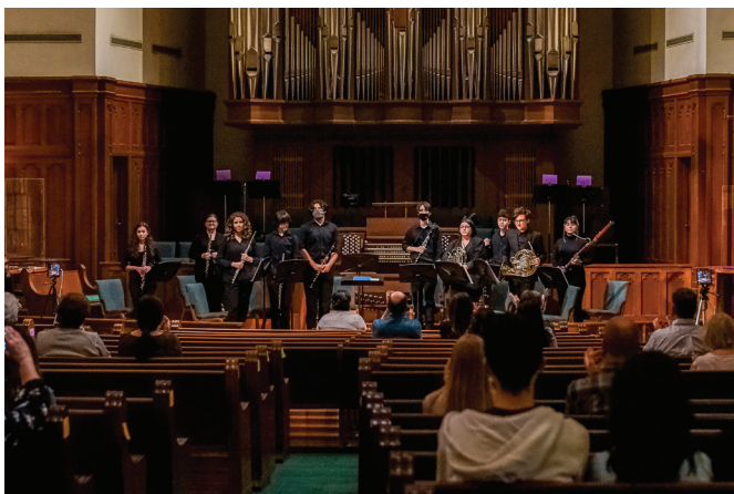
YOSA Spring Quintet Showcase

You can imagine, then, that it was a huge thrill for YOSA to present its first live concert on Sunday evening, March 28. The YOSA Spring Quintet Showcase featured two wind quintets and one brass quintet, comprising 15 of our most advanced young musicians. Before a small but enthusiastic audience of friends and family at Laurel Heights United Methodist Church, these groups beautifully performed a spirited and engaging program, which was also livestreamed via YOSA's YouTube and social media channels. I can't overstate what a joy it was! If you missed it, consider visiting music.yosa.org/youtube to enjoy the video.