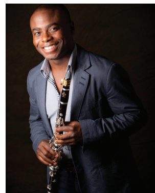
Anthony McGill, clarinet

Clarinetist Anthony McGill will be our guest soloist on May 23, performing the beautiful Mozart Clarinet Concerto. The New York Philharmonic's first African-American principal player, McGill has been hailed by the New York Times for his "trademark brilliance, penetrating sound, and rich character" and serves on the faculties on two of the world's best-known conservatories, the Juilliard School and the Curtis Institute of Music. You may remember his performance at the 2009 inauguration of President Obama, premiering music by John Williams alongside violinist Itzhak Perlman, cellist Yo-Yo Ma, and pianist Gabriela Montero.